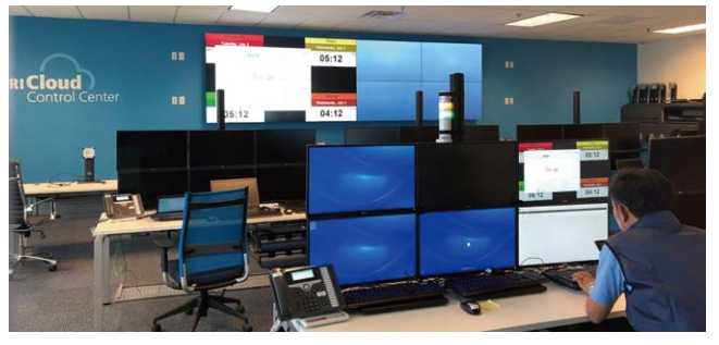
Global monitoring base (C3UD) in Dallas, U.S.

In addition to the hybrid cloud-integrated operations using mPLAT Suite, NRI IT Solutions uses the global monitoring base (C3UD) located in Dallas, U.S. Using C3UD to monitor the platforms of U.S. customers achieves stable hybrid cloud operations 24/365 in Japan and the U.S.